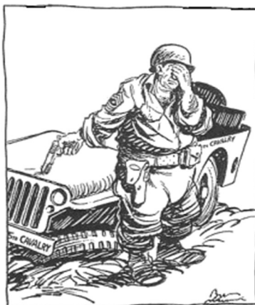
"Goodbye, old friend." – Bill Mauldin